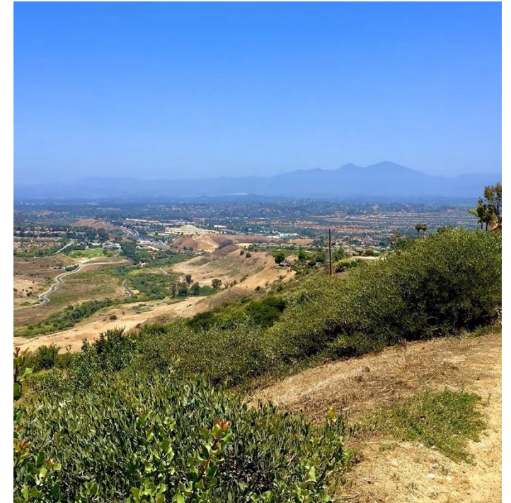
Southern California Partnership – RCD of Greater San Diego County $5M CAL FIRE Forest Health $5M CAL FIRE Wildfire Prevention