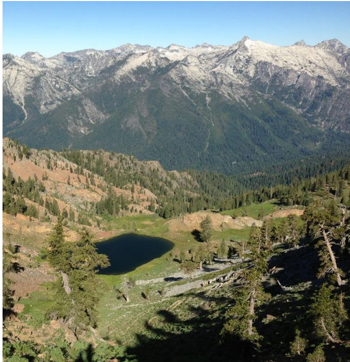
North Coast Resource Partnership – Humboldt County $10M CAL FIRE Forest Health